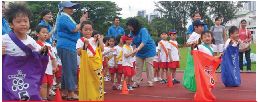
Colourful sack race

A fun time was had by all at the Sports Day events, when students, parents and staff from Chiltern House gathered at Toh Payoh Sports Stadium on 14th and 21st May for some healthy competition.