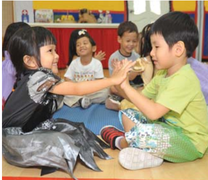
Peers enjoy playing together