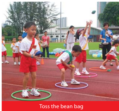
Toss the bean bag