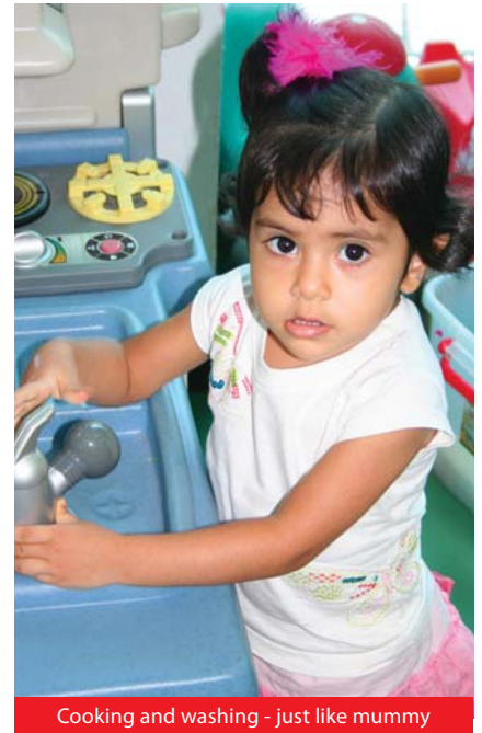
Cooking and washing - just like mummy

We all make mistakes and have negative experiences. That is part of life and growing up. But the child who knows they have the unconditional acceptance of important people in their lives, will feel empowered to 'bounce back' from their mistakes, learn from them, and continue to try new things, seeking out new experiences that will help them to develop and grow as a person.