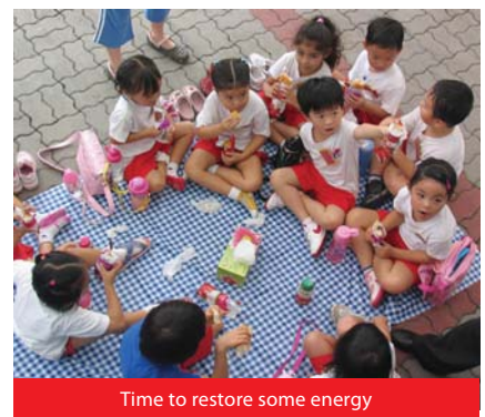
Time to restore some energy