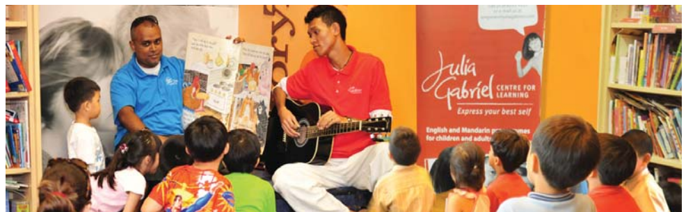
Teachers lead an interactive storytelling session

Teachers in bright red tee shirts; a musician strumming his guitar; a cheerful family of country green bears or exuberant red bears; colourful storybooks and a host of smiling faces - maybe you spotted one of these while out and about with your family one weekend!