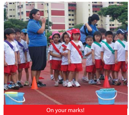
On your marks!