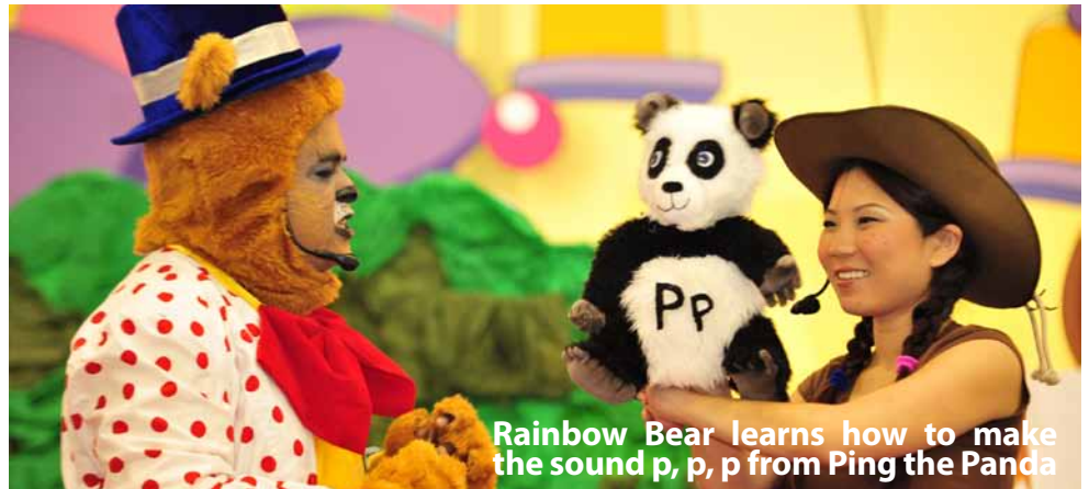
Rainbow Bear learns how to make the sound p, p, p from Ping the Panda

As we make our way through life, we play many roles. We have to wear many hats: The hats of baby, child and sibling; the hats of teacher, mentor and guide; the hats of parent, protector, colleague, boss; the hats of neighbour, friend; and, no matter what our age, always the hat of learner.